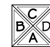
KEY TO ELEVATION